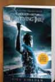
The Lightning Thief Film Edition