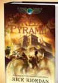
The Red Pyramid

And don't miss Rick's new series, The Kane Chronicles , Book One: The Red Pyramid