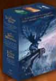
Paperback Boxed Set