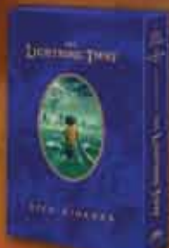
The Lightning Thief Deluxe Edition