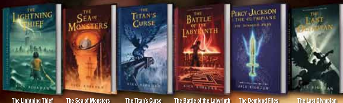
The Lightning Thief