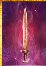
SWORD OF SUMMER